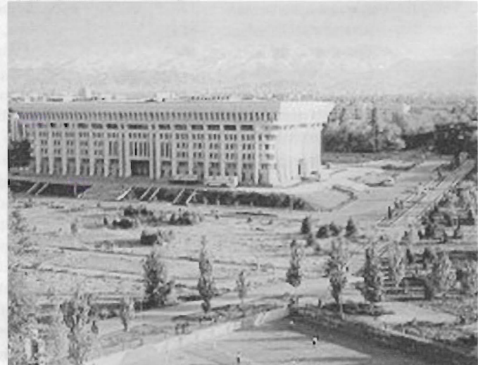
Kyrgyz government building

Drug profits have also been used to help traffickers raise 'armies' to protect their position in the drugs trade. In many respects the incursions into Kyrgyzstan and Uzbekistan by the Islamic Movement of Uzbekistan, in the summers of 1999 and 2000, fall