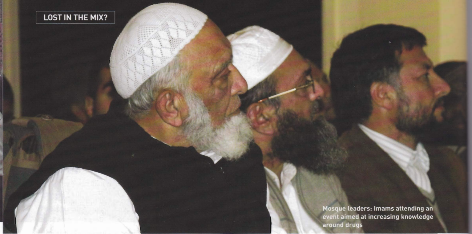
Mosque leaders: Imams attending an event aimed at increasing knowledge around drugs